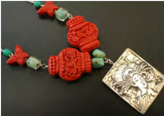
Geisha Lantern Necklace Handmade Geisha 925 Sterling Silver pendant w/Cinnabar & turq beads & chain Size 18"