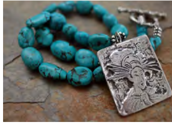
Turquoise Geisha Necklace Handmade Geisha 925 Sterling Silver pendant w/Turquoise beads Size 18"