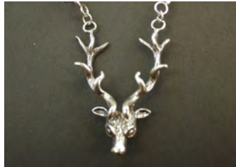
Deer Huntress Necklace Remake of Vintage Deer Head .925 Sterling Silver w/ Hand-made Antler Chain. Size 18"