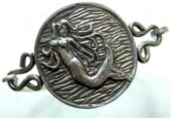
Mermaid Bracelet Handmade Mermaid 925 Sterling Silver Tension Bracelet Sizes: S-6", M-6.5", L-7", XL-7.5"