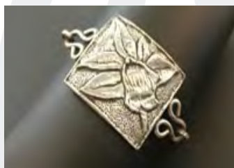
Orchid Bracelet Handmade Orchid 925 Sterling Silver Tension Bracelet Sizes: S-6", M-6.5", L-7", XL-7.5"