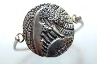
Wave Bracelet Handmade Wave 925 Sterling Silver Tension Bracelet Sizes: S-6", M-6.5", L-7", XL-7.5"