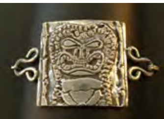
Tiki Bracelet Handmade Tiki 925 Sterling Silver Tension Bracelet Sizes: S-6", M-6.5", L-7", XL-7.5"