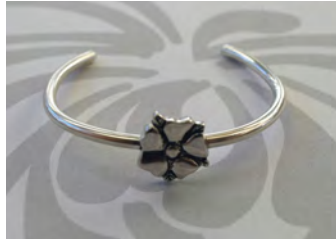
Blossom Baby Bracelet Handmade Cuff with Blossom. Sterling Silver 3.5"