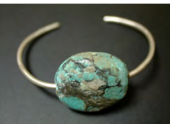
Turquoise Cuff Handmade Turquoise Sterling Silver Cuff Sizes: 6.5"