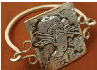
Geisha Bracelet Handmade Geisha 925 Sterling Silver Tension Bracelet Sizes: S-6", M-6.5", L-7", XL-7.5"