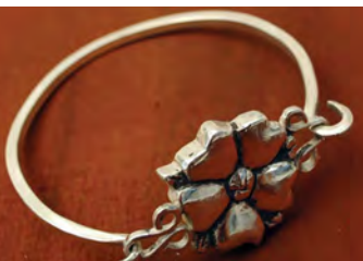
Blossom Bracelet Handmade Blossom 925 Sterling Silver Tension Bracelet Sizes: S-6", M-6.5", L-7", XL-7.5"