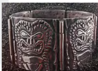
Tiki Bracelet Handmade Tiki bracelet w/5 Links hidden box clasp Size -7.5"