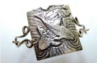
Koi Bracelet Handmade Koi 925 Sterling Silver Tension Bracelet Sizes: S-6", M-6.5", L-7", XL-7.5"