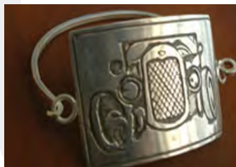
Roadster Bracelet Handmade Roadster 925 Sterling Silver Tension Bracelet Sizes: S-6", M-6.5", L-7", XL-7.5"