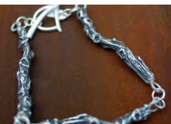
Twig Toggle Handmade Twig Chain with Toggle .925 Sterling Silver Size 7"