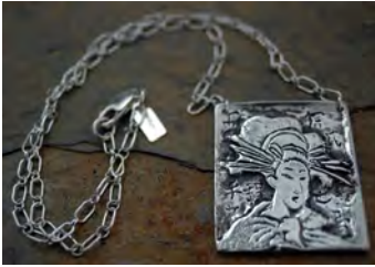
Geisha Necklace Handmade Geisha 925 Sterling Silver pendant w/chain Size 16"