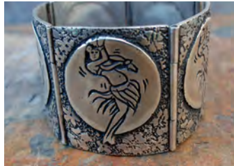
Hula Bracelet Handmade Hula bracelet w/5 or 6 links Links hidden box clasp Size - 7" or 7.5"