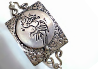
Hula Bracelet Handmade Hula 925 Sterling Silver Tension Bracelet Sizes: S-6", M-6.5", L-7", XL-7.5"