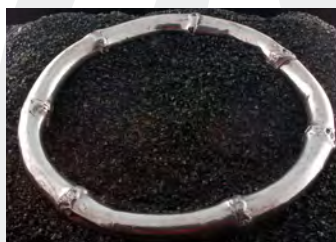
Bamboo Bangle Handmade Sterling Bamboo Bangle. Bangle is solid and heavy.