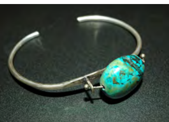
Turquoise Cuff Handmade Turquoise Sterling Silver Fabricated Cuff Sizes: 6.5"