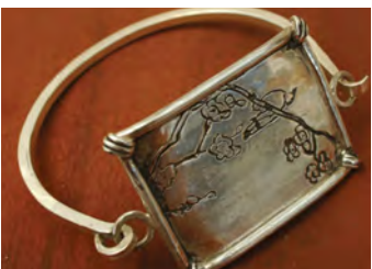
Bird on Blossom Bracelet Handmade Bird on Blossom 925 Sterling Silver Tension Bracelet Sizes: S-6", M-6.5", L-7", XL-7.5"