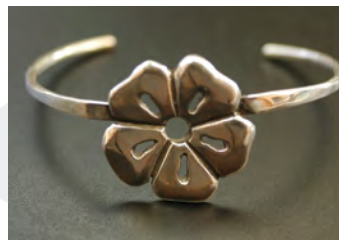
Sakura Cuff Handmade Sterling Silver Sakura cuff. Size 6.5"